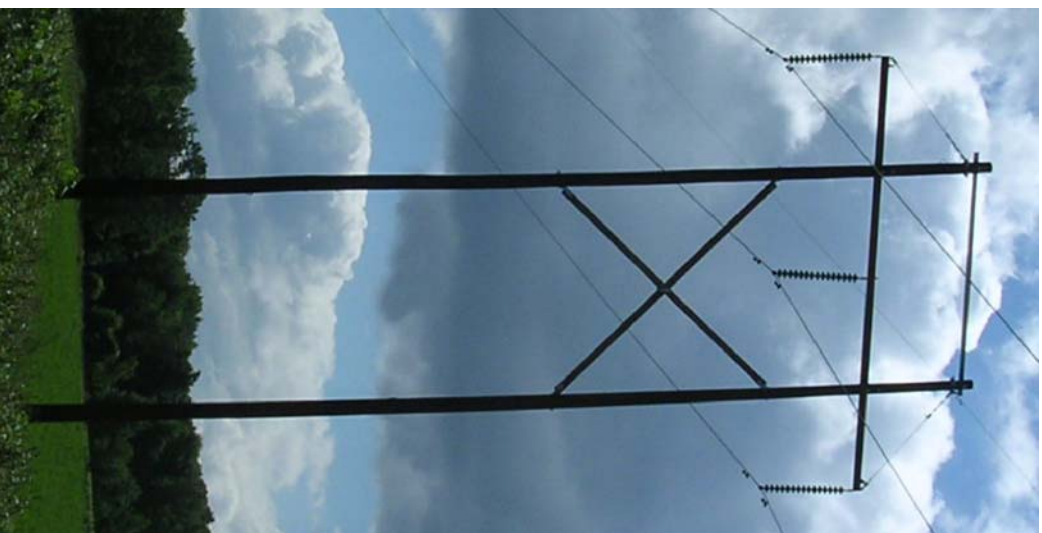
230 kV TANGENT STRUCTURE 800 FT. TYPICAL SPAN